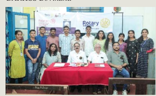
Rotary Club Kasaragod Sponsored New Rotaract Club of Govt College Kasaragod Formation meeting held at Govt College Kasaragod