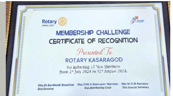
Recieved Certificate of Recognition to RC Kasaragod Form District Governer for inducting 12 new members in membership Challange